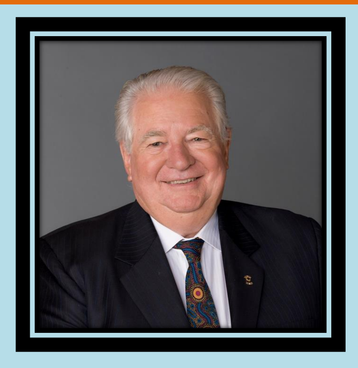
Thanks to Lions Club of Triangle Annual Soccer Fundraiser Get to know your Lions Food for thought